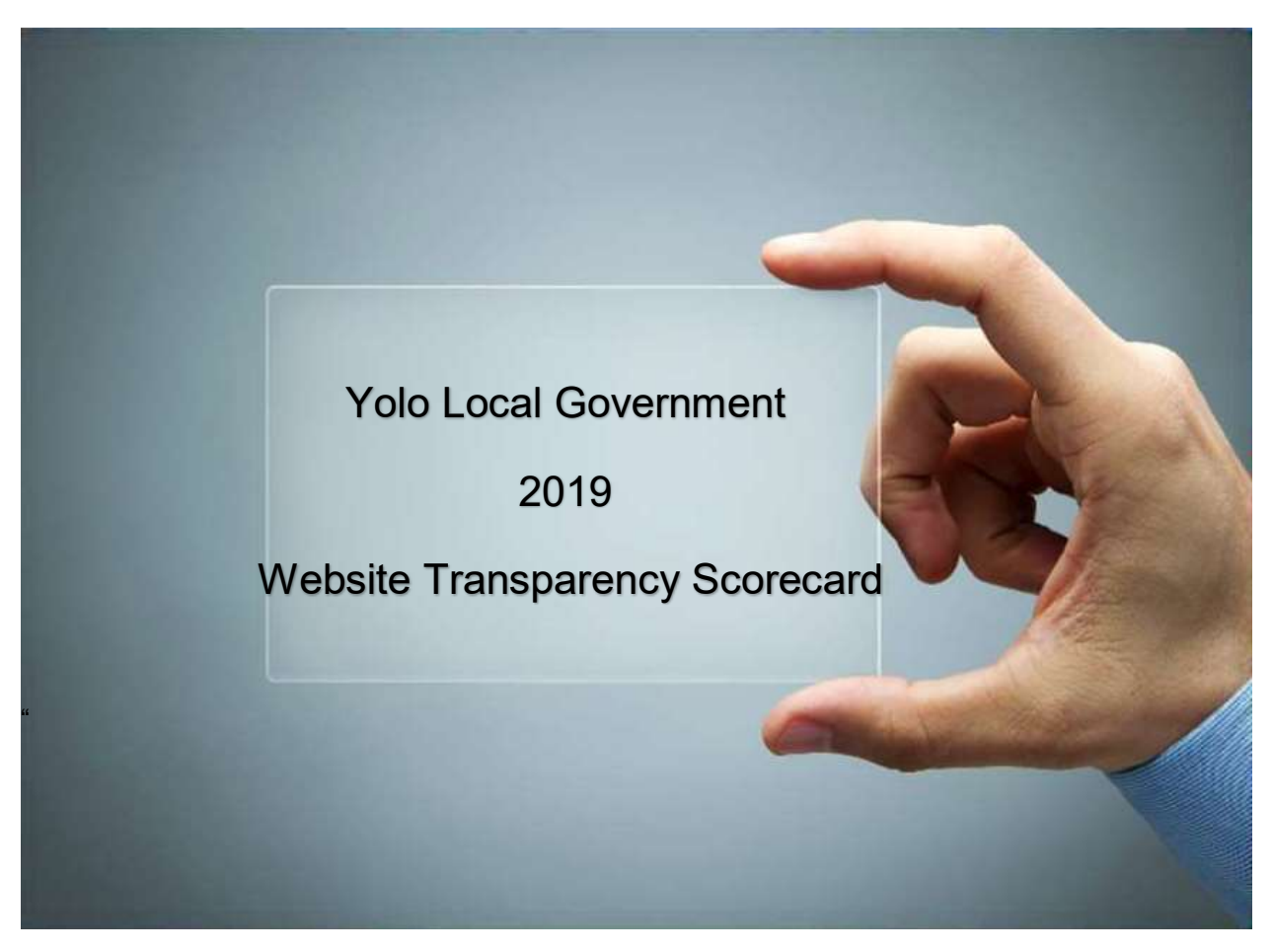
"A lack of transparency results in distrust and a deep sense of insecurity."