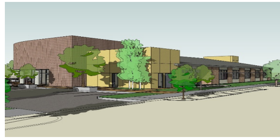
W. Sacramento Branch Library (completion date late 2009)