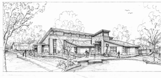
Winters Branch Library (completion date summer 2009)