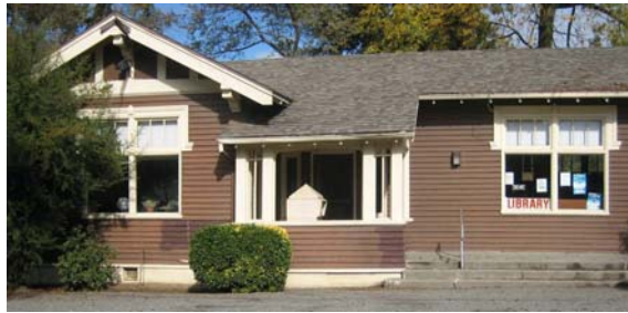
Yolo Branch Library