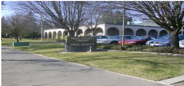
Davis Branch Library